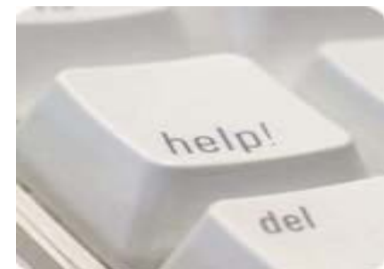
UT onsite service guarantee