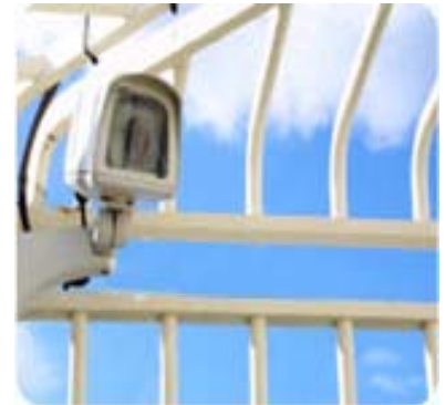
Home or Office CCTV monitoring is must

Essentially, any place where there is a requirement to perform surveillance for security or supervisory purposes, Unitech CCTV solutions can be used.