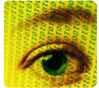
Digital Eye For ultra-secure premises

Essentially, any place where there is a requirement to perform video and audio surveillance, Unitech DVR solutions can be used.