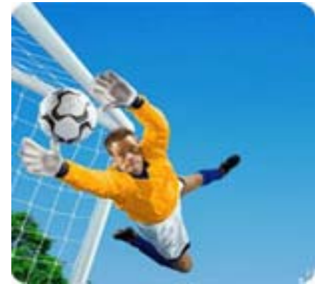
Every second matters when competition is high

Please call us now for a free consultation about your computing needs.