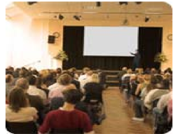
Big Presentation - Don't be let down by broken projector

Increases effective visibility by 50%, so your presentation looks bright and clear even in well lit rooms.