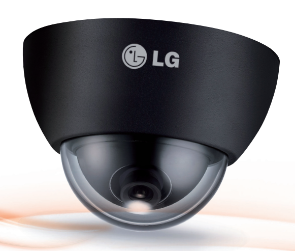
L6204-D/6104-D (Surface Type / Black)

VANDAL PROOF MINI-DOME CAMERA L6204-D/6104-D