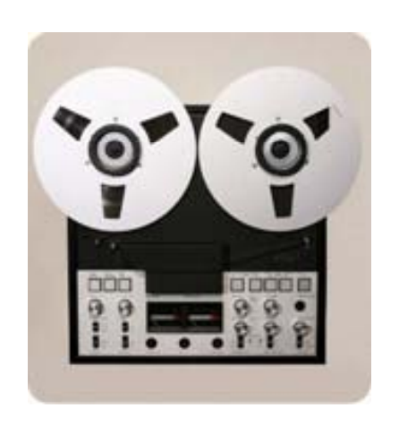
Get rid of old monitoring technologies

With our experience in Communication, you can count on UBM to bring you best of the breed technology at affordable prices.