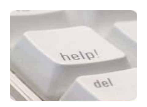
UT onsite service guarantee

If you are only interested in support and service contract for your existing investment in personal computers, please contact us at: <a href="mailto:info@unitedtechnologies.com.pk">info@unitedtechnologies.com.pk</a> We will make every effort to help you extend your existing investment in computer hardware.