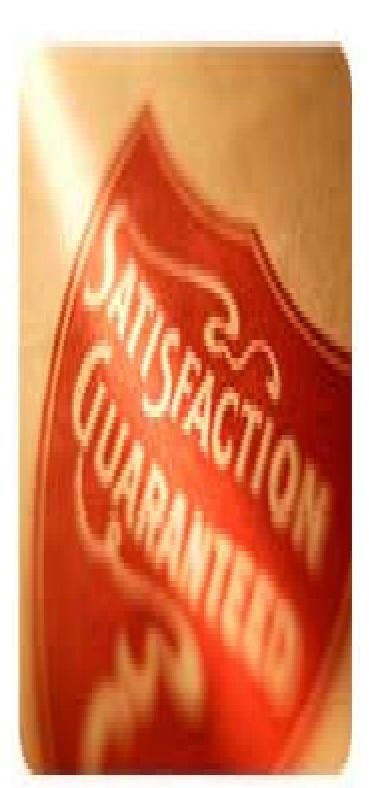
United Technologies Peace of mind