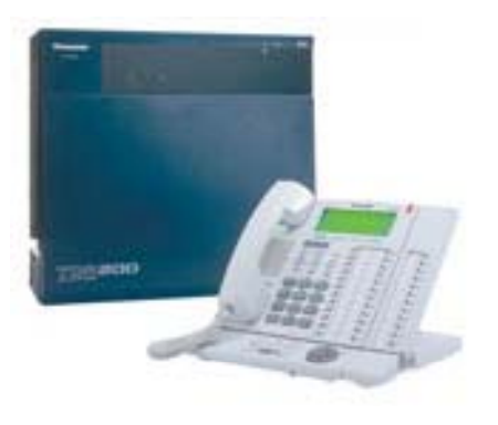
PBX Variety and Experience of UT

We can help setup a small 3x8 exchange (3 PTCL lines, 8 intercom extensions) as well as the biggest Panasonic models with up to 500 extensions. We currently deal in the following Panasonic series: TEM, TES and TDA.