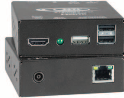
XTENDEX® ST-C6USBHU-300 (Remote and Local Unit)

The XTENDEX® HDMI USB KVM Extender provides remote KVM (USB keyboard, USB mouse and HDMI monitor) access to a USB computer up to 300 feet (91 meters) over CAT5/6/7 cable. Each ST-C6USBH-300 consists of a local unit that connects to a computer, and a remote unit that connects to a keyboard, monitor and mouse. The local and remote units are interconnected via CAT5/6/7 cable.