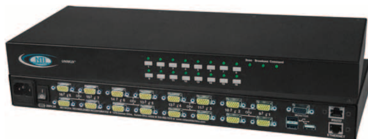
UNIMUX-USBV-16HDU (Front & Back)

The UNIMUX™ High Density VGA USB KVM Switch allows a user to control up to 32 USB computers with one USB keyboard, USB mouse and VGA monitor. Dedicated internal microprocessors emulate keyboard and mouse presence to each attached CPU 100% of the time so all computers boot error-free.