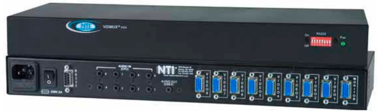
VIDMUX® SE-AV-8-RS (Front & Back)

The VIDMUX® VGA video switch enables up to 16 computers to be connected to a single video monitor, projector or LCD/plasma screen.