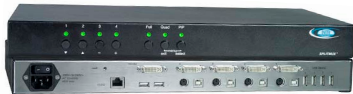
SPLITMUX-DVI-4 (Front & Back)

The SPLITMUX® DVI/VGA Quad Screen Multiviewer allows you to simultaneously display video from four different computers on a single monitor. Additionally, it can switch one of the four attached computers to a shared keyboard and mouse for operation and to four additional USB devices.