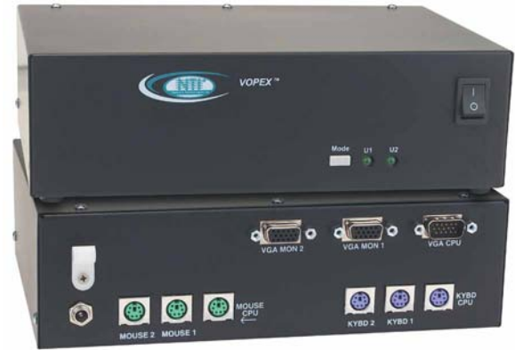
VOPEX-2KVM-A (Front & Back)

The VOPEX® VGA PS/2 KVM splitter allows up to four users to share the use of one PS/2 computer.