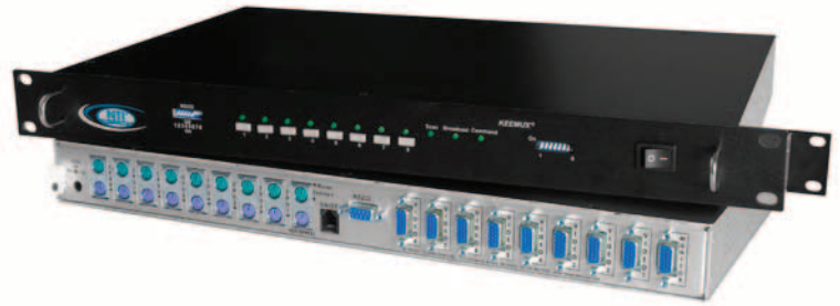
KEEMUX-P8-R-RS (Front & Back)

The KEEMUX® PS/2 KVM switch allows one keyboard, monitor and mouse to control multiple PCs (up to 128 computers). Dedicated internal microprocessors emulate keyboard and mouse presence to each attached PC 100% of the time so all computers boot error free.