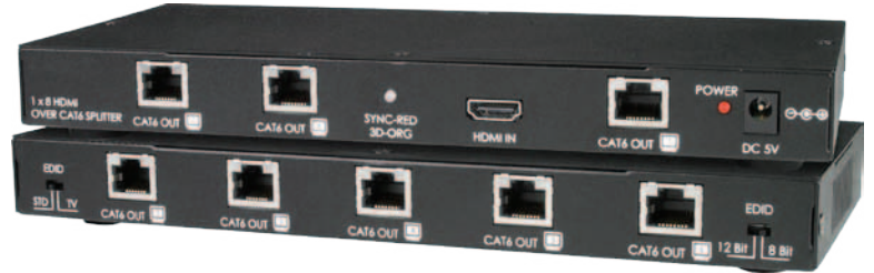
VOPEX-C6HD-8LC Local Unit (Front & Back)