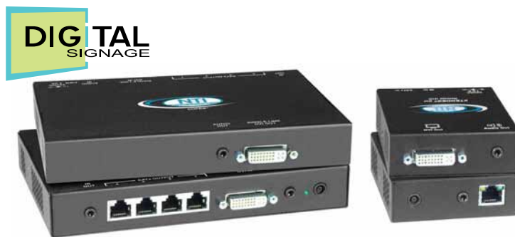
VOPEX-C6DVI-LA-4 Local Unit (Front & Back) and ST-C6DVI-IR-R-300 Remote Unit

The VOPEX® DVI Splitter/Extender simultaneously distributes high resolution single link digital DVI video from one video source to up to 4 displays, each located up to 300 feet (91 meters) away using a single CAT5e/6/7 cable.