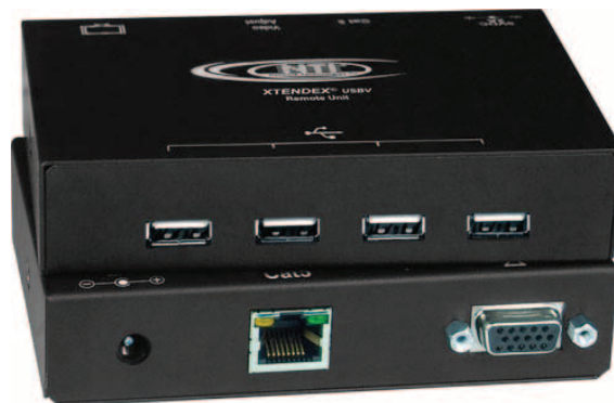
ST-C5USBVT (Remote Unit, Front and Back)

The Transparent VGA USB Extender extends four USB devices and a VGA monitor up to 200 feet (61 meters). Each USB extender consists of a local unit that connects to a computer and also supplies video to a local monitor, and a remote unit that connects to four USB devices and a monitor.