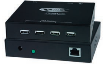
USB-C5-CE (Remote Unit, Front and Back)

Extends four USB devices up to 100 feet.