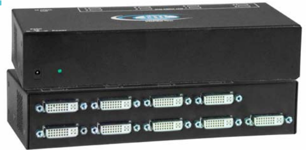
VOPEX-DVIS-8 (Front and Back)

The VOPEX® DVI Video Splitter enables up to 16 single link digital DVI displays to be driven by a single digital DVI source with no loss of signal.