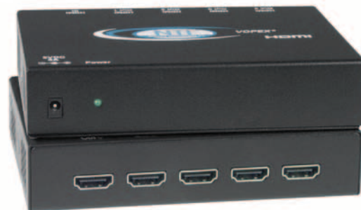
VOPEX-HDS-4 (Front and Back)

The VOPEX® HDMI Video Splitter enables up to 16 HDMI displays to be driven by a single HDMI source with no loss of signal.