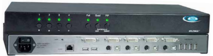
SPLITMUX-DVI-4 (Front & Back)

The SPLITMUX® DVI/VGA Quad Screen Multiviewer allows you to simultaneously display video from four different computers on a single monitor. Additionally, it can switch one of the four attached computers to a shared keyboard and mouse for operation and to four additional USB devices.