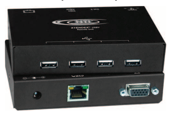
ST-C5USBVT (Remote Unit, Front and Back)

The Transparent VGA USB Extender extends four USB devices and a VGA monitor up to 200 feet (61 meters). Each USB extender consists of a local unit that connects to a computer and also supplies video to a local monitor, and a remote unit that connects to four USB devices and a monitor.